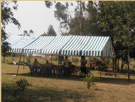
LOMAA self-help group with their new JHH tent. They rent it out and help their community.