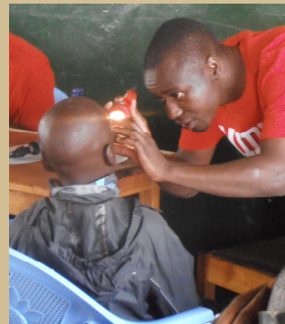
Children receiving care at the third annual 2015 Eye Clinic. To date we have provided 300 cataract surgeries & 600 pairs of reading glasses.