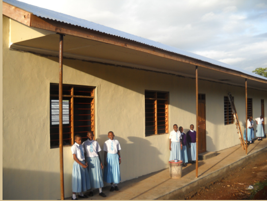
Form VI Classrooms we just completed in Tanzania at Usambara School for Girls in Korogwe, Tanzania.