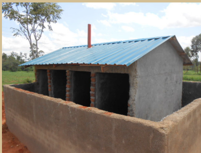
Latrines under construction at Emutondo Primary in Butere, Kenya.