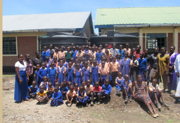
New Water Collection Tanks at Hannah's Hope. Everyone at Hannah's Hope is so happy!