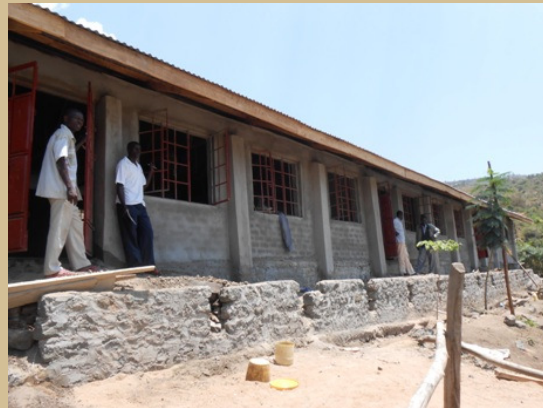
Three-Classroom Block we are currently building at Lake View Boda Academy in Homa Bay.

Joining Hearts & Hands, Ltd. 9 Fieldston Grove Fairport, New York 14450 Phone: 585-377-8298