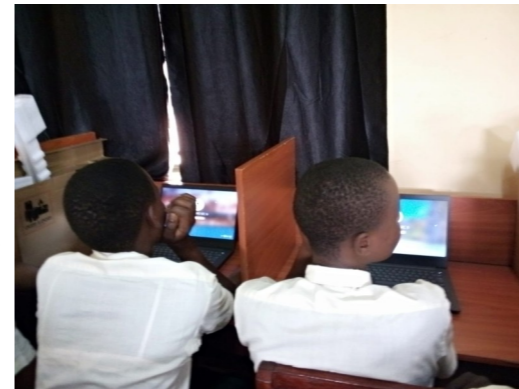
Students getting initial instruction