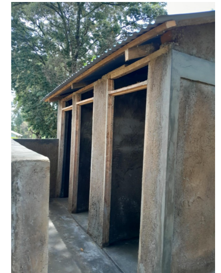
The progression of latrine construction from digging the pits, lining the pits with brick, and then the above ground construction