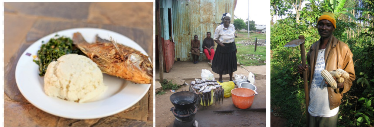
Left to right: typical Kenyan dish. Fishmonger selling and cooking fish. Farmer with Maiz crop for Ugali

One of the many things we LOVE about Kenya in addition to its beautiful people is the food. It is a totally different experience from our American cuisine. While we essentially deal with the challenges of African life, there is so much to celebrate. In this issue of our newsletter we celebrate the joy of Kenya's culinary delights!