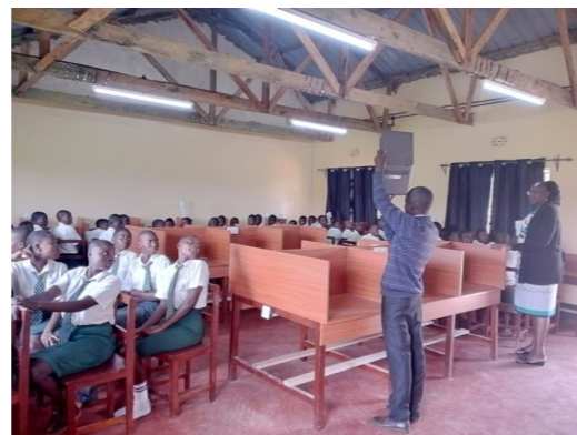
Laptop instruction at Mang'uliro