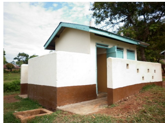
One latrine block prior to receiving finish and then a final structure