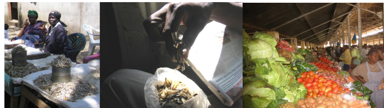
Left to Right: Omena (small fish fried served with Ugali). Fried termites as a delicacy! We have not been brave enough to try these! And a Kisumu market where you can get all of your culinary delights!

We can't tell you how many times over the years we have had this typical dish of Nyanza, Kenya. Kisumu is located on the shores of Lake Victoria. Lake Victoria is the world's largest tropical lake and the second largest fresh water lake in the world. And so it is fish country. They call the fish on the left tilapia, but it is nothing like the tilapia we find in our grocery stores. When in Kenya we always order a " rech maduong " (big fish in the Luo language). It is wonderfully sweet and delicious when fried and smothered in greens and tomatoes. The greens you see are called sukuma wiki . This is a dish made from greens like kale, onions and various spices. The large white ball is the mainstay of just about every Kenyan we know. It is ugali . It is generally made from corn flour but also made from millet for dark ugali (not our favorite). A meal without ugali is just not a meal! Ugali is eaten with the hands and used like a spoon for the greens.