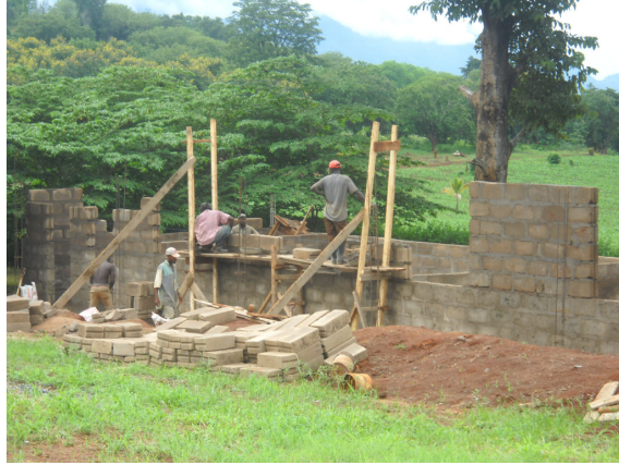
Classrooms at Usambara under Construction

Western Presbyterian Water Project Nearing Completion. Thanks to the dynamite group from Western Presbyterian in Palmyra, this multi-phase, multi-year project is in its third and final stage. The water purification plant is under construction and will be completed within the next month or two.