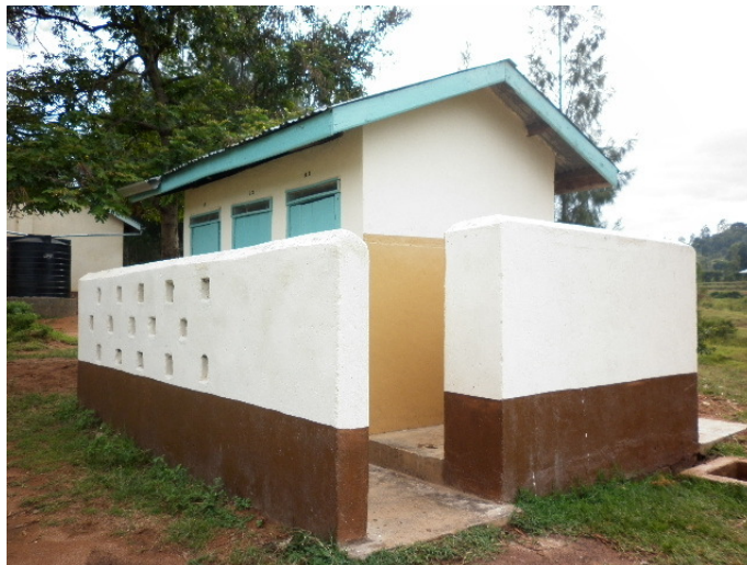
One of the two refurbished student latrines

Three new classrooms are under construction by JH&H at Usambara Girls' School in Korogwe, Tanzania. To date JH&H has built twelve (12) classrooms there.