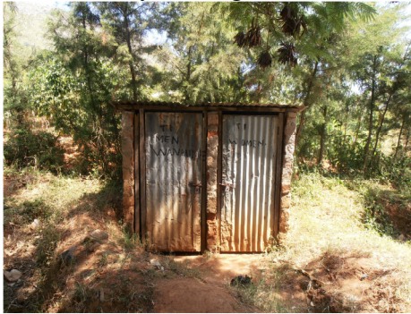
Teachers' Latrines BEFORE

New latrines have just been completed for teachers at Mbaka Oromo and the student latrines built by Joining Hearts and Hands 5 years ago have been refurbished.