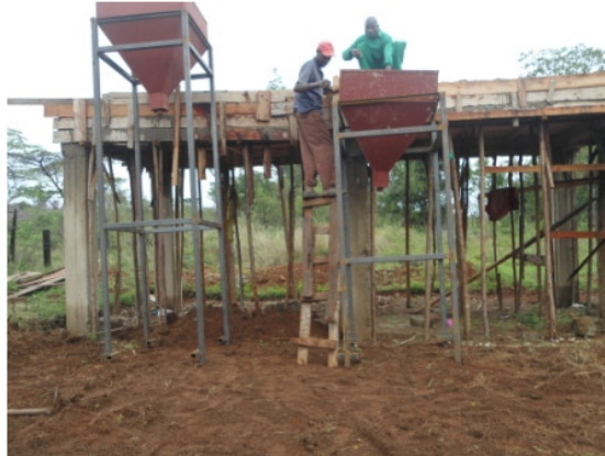
Kongasis Water Treatment Plant Under Construction

Western Presbyterian Water Project Nearing Completion. Thanks to the dynamite group from Western Presbyterian in Palmyra, this multi-phase, multi-year project is in its third and final stage. The water purification plant is under construction and will be completed within the next month or two.