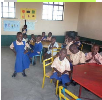
Children at Hannah's Hope showing what they have learned!