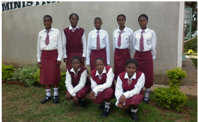
Joining Hearts and Hands Scholarship Students from Shitoto High School