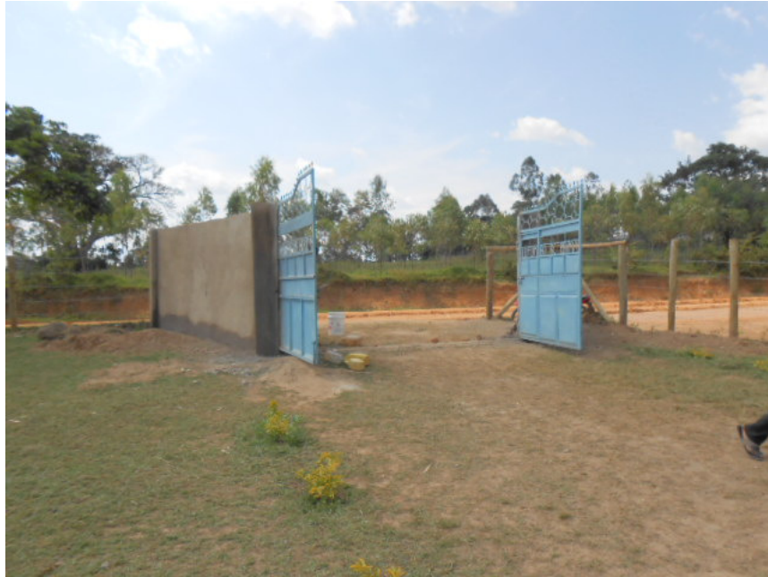
Gate and Fencing at Lufumbo