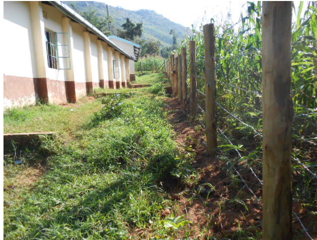
Fencing at Mbaka Oromo

Construction is underway for a security project at Mbaka Oromo Primary school in Maseno, Kenya. This project involves surrounding the entire campus in fencing and with security gates. The fencing is necessary to keep animals out of the compound and prevent people from using the schools toilets. This is a massive project as the compound consists of over 10 acres of campus. Check out the progress above. Fencing includes pressure treated posts and barbed wire. The Mbaka Oromo school community is planting “live fencing” all along the fencing. Live fencing consists of plants (generally with thorns) that weave their way through the fence and make a solid wall and virtually impenetrable. Joining Hearts and Hands completed a similar project in Lufumbo earlier this year.