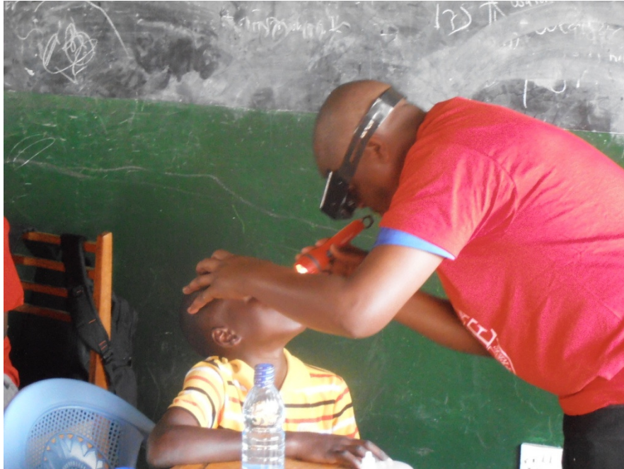
Kenyan ophthalmologist examines Katito student