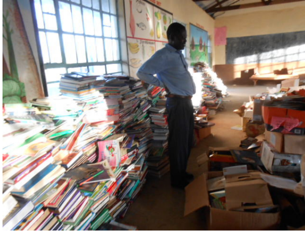
Lufumbo Principal checking out the amazing delivery