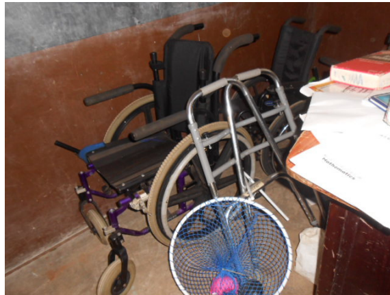
Wheel chairs and walkers from Rochester