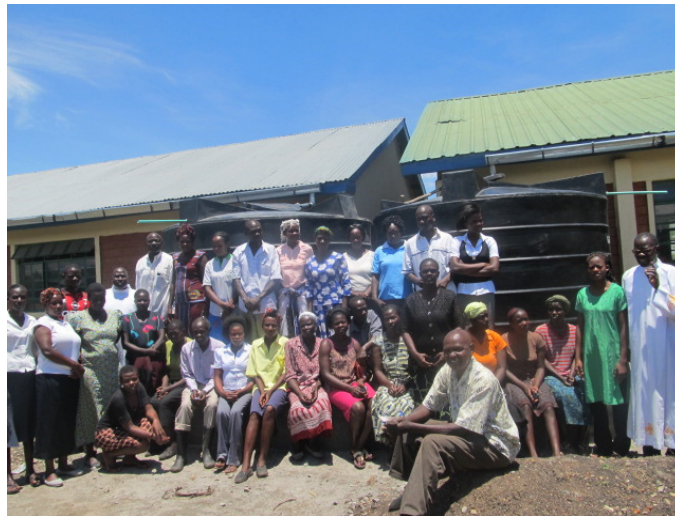
Community Gathers at New JH&H Water Tanks

We are just completing a water harvesting project at Hannah's Hope. This involves collecting rain water from the school roofs in two large (10,000 gallon each) collection tanks. Check out the happy Hannah's Hope community surrounding the tanks!