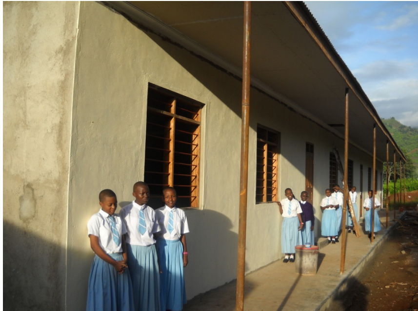
Form VI Classroom built by Joining Hearts and Hands