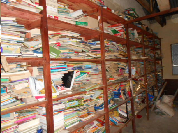
A few thousand of the over 20,000 books delivered