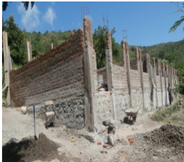
Lake View Boda Classrooms Currently under construction

Thanks for all of your support. Without YOU, none of this could happen. Thanks for your generosity. Thanks for your encouragement. Thanks for your love. Thanks for your prayers.