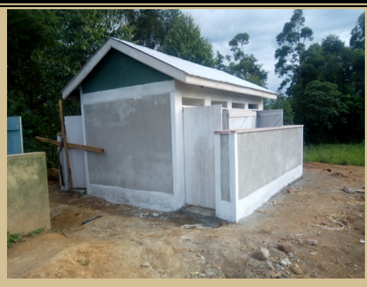
One of Two JHH latrine blocks currently under construction at a high school in Western, Kenya