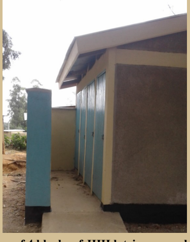
One of 4 blocks of JHH latrines completed at Mang'uliro Primary School in Western

Joining Hearts & Hands, Ltd. 6944 Benedict Beach Hamlin, NY 14464 Phone: 585-377-8298