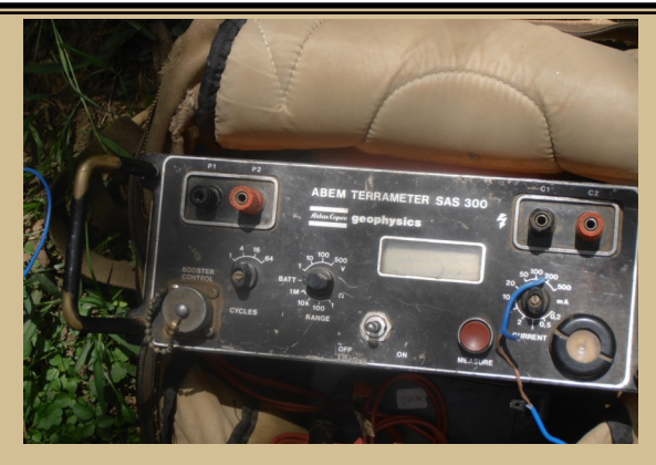
Doing a geological survey before drilling a JHH well at Springs of Life Orphanage in Butere, Kenya