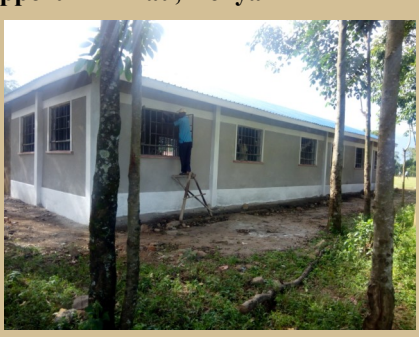
New Classrooms being built at Mang'uliro Primary school by JHH. Funded by the good people at Mindex in Rochester, NY.