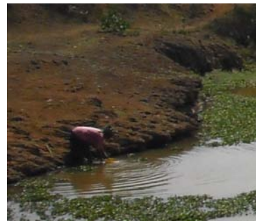
Usenge woman collecting polluted water for drinking

The key to our work is not to simply hand out donations, but to provide opportunities for self-sustainability. Please check our website for details!