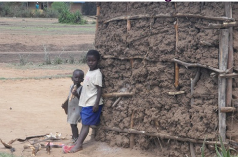
Kids in the Village of Katito, Kenya