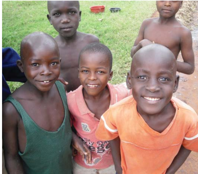
The Boys from Homa Bay, Kenya