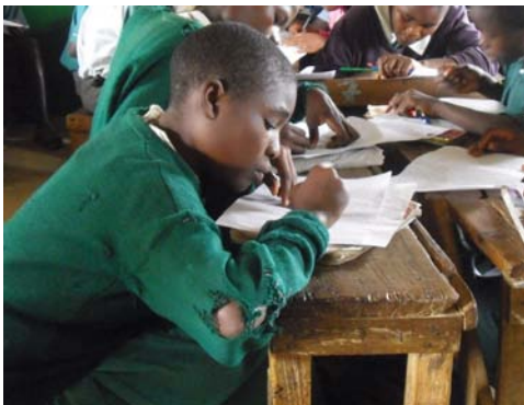
Pen Pal letter writing to U.S.A.

There is no better way to celebrate our blessings than by giving to the less fortunate. Help these children by providing a future with the hope of exiting brutal poverty.