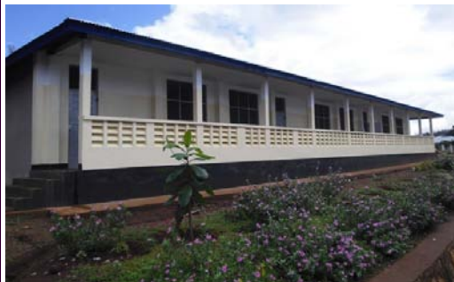
Three-Classroom Form II Block built in Tanzania